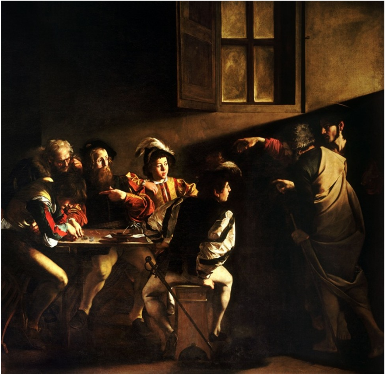
Caravaggio circa 1600