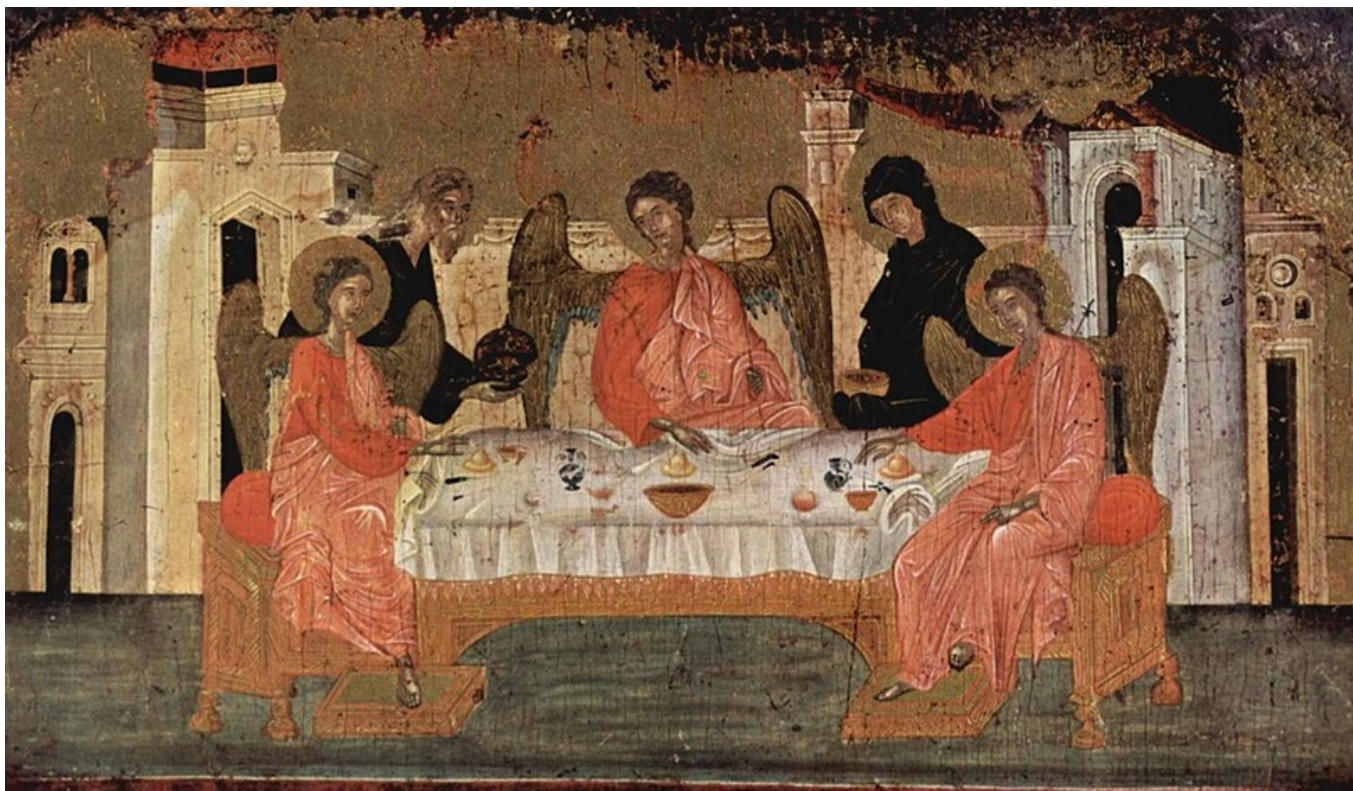
Late 14 th century