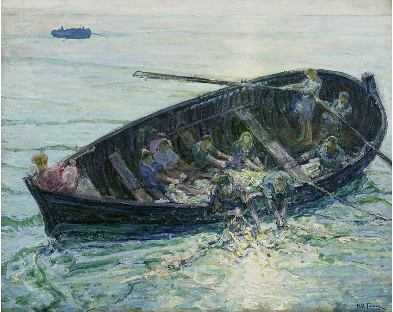
Henry Ossawa Tanner 1913-14