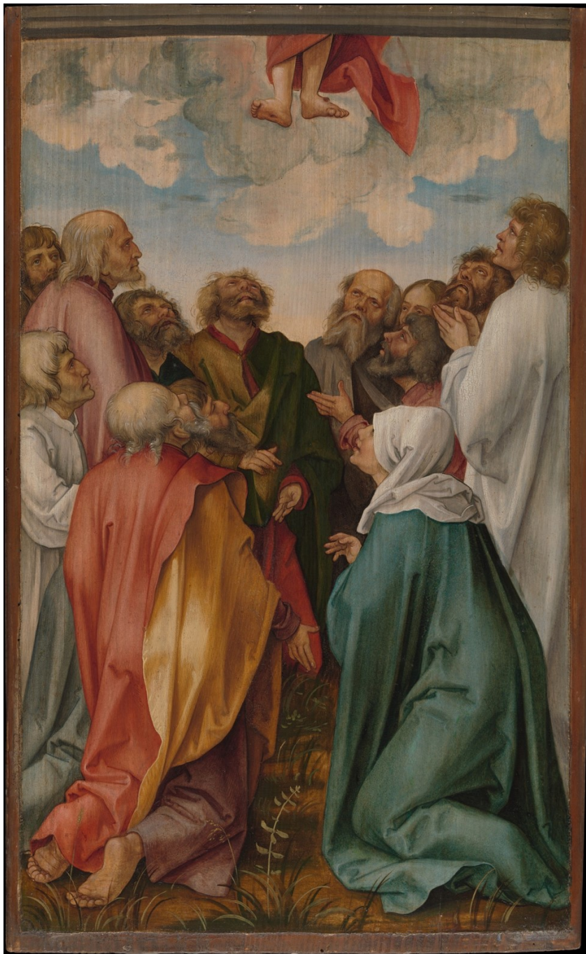
Hans Suss von Kulmach 1513