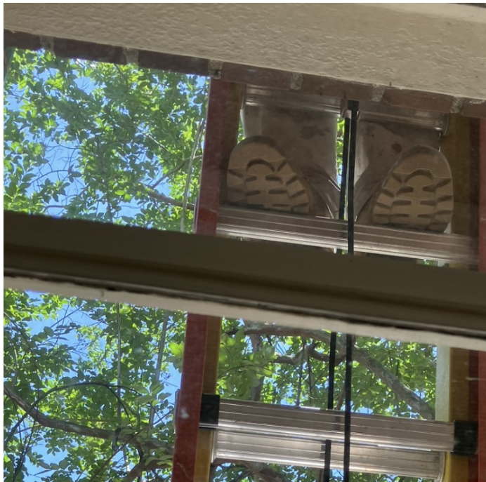
Alternate Cover for the Ascension...