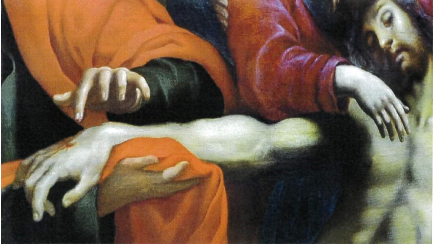
Unknown Circa 1700