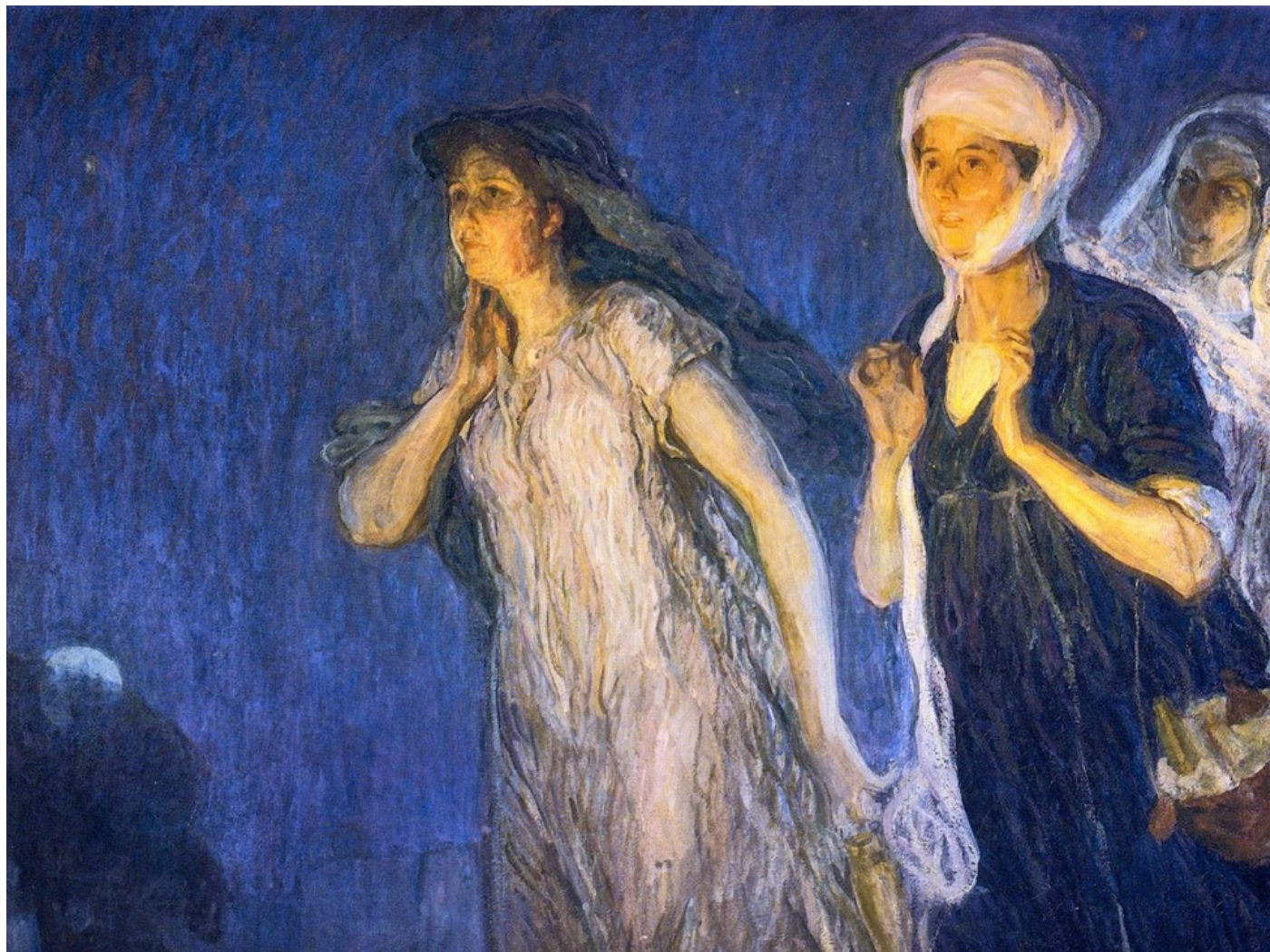
Henry Ossawa Tanner 1910