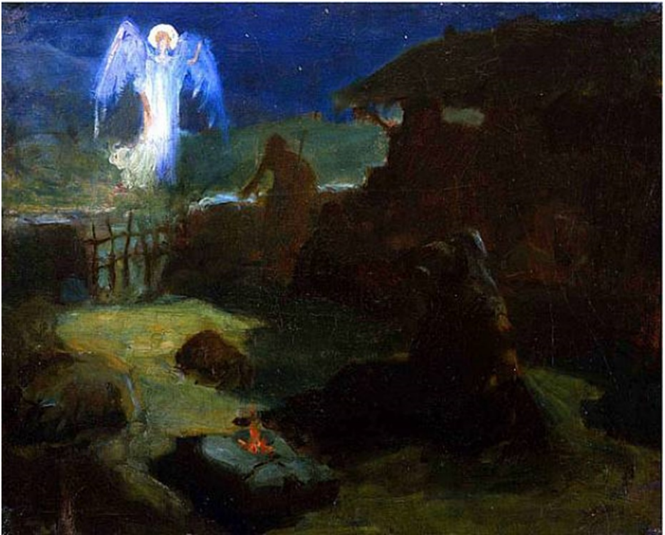
Henry Ossawa Tanner 1895