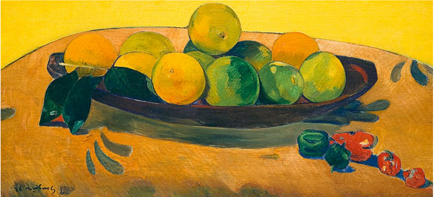
Paul Gauguin 1892