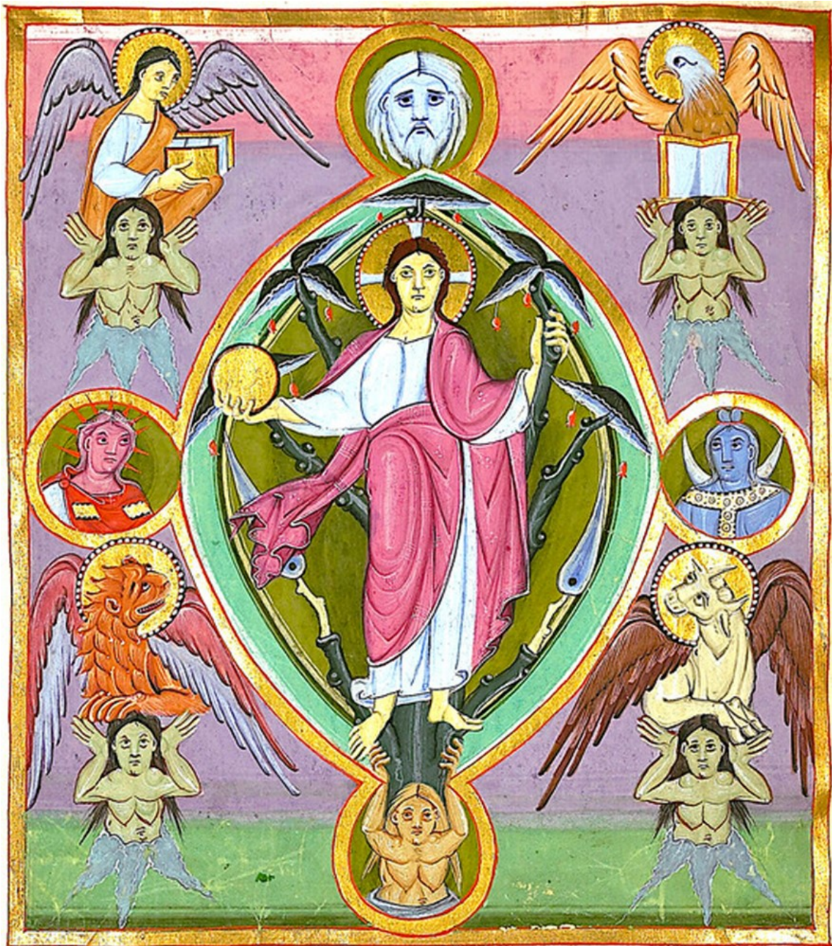
Circa 1000 AD