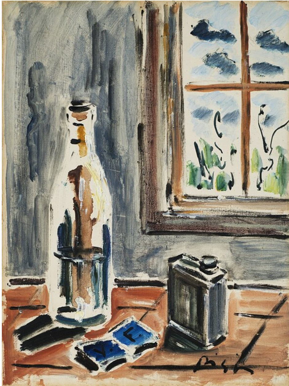
Fillippo de Pisis 1950