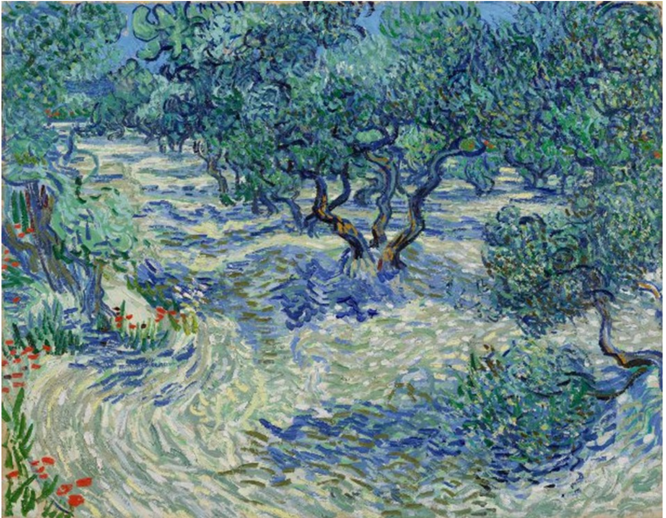
Van Gogh 1889