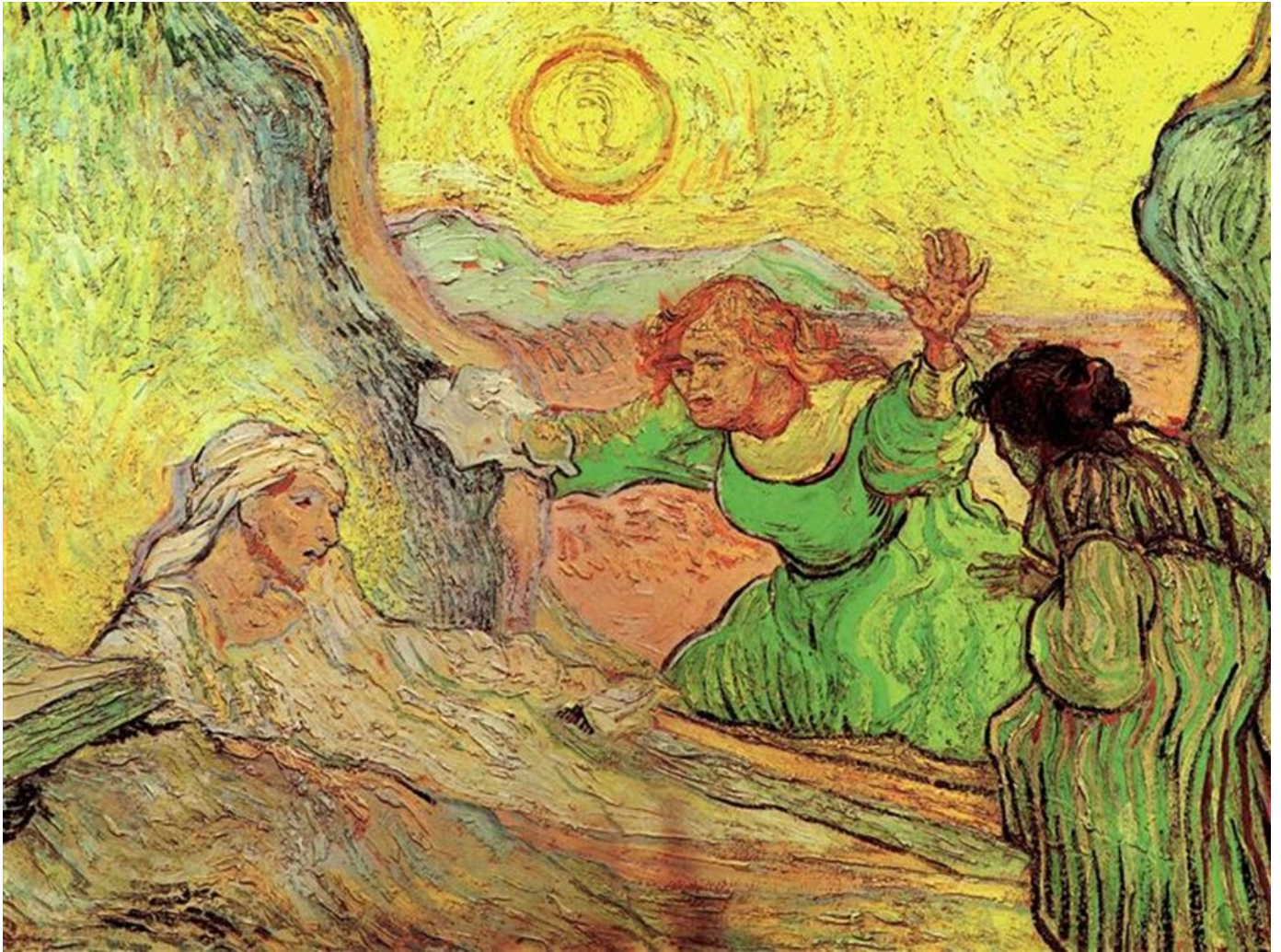
Van Gogh 1890