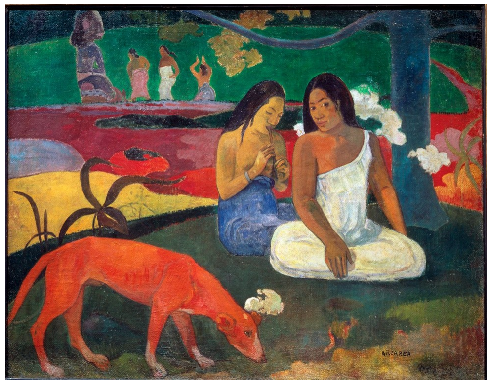
Paul Gauguin 1892