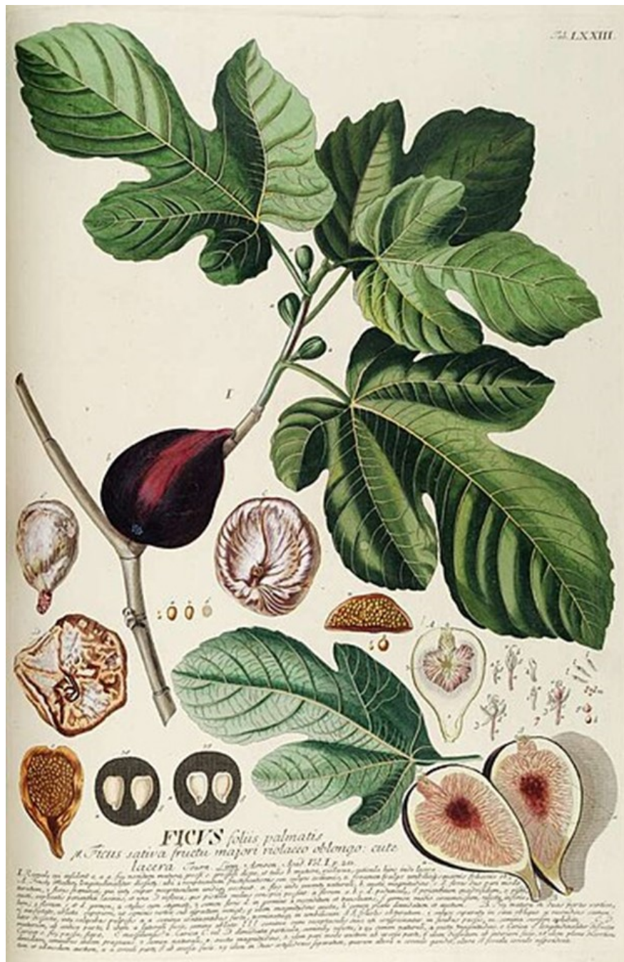
G.D. Ehret 1771