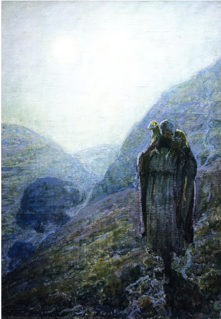
Henry Ossawa Tanner 1922