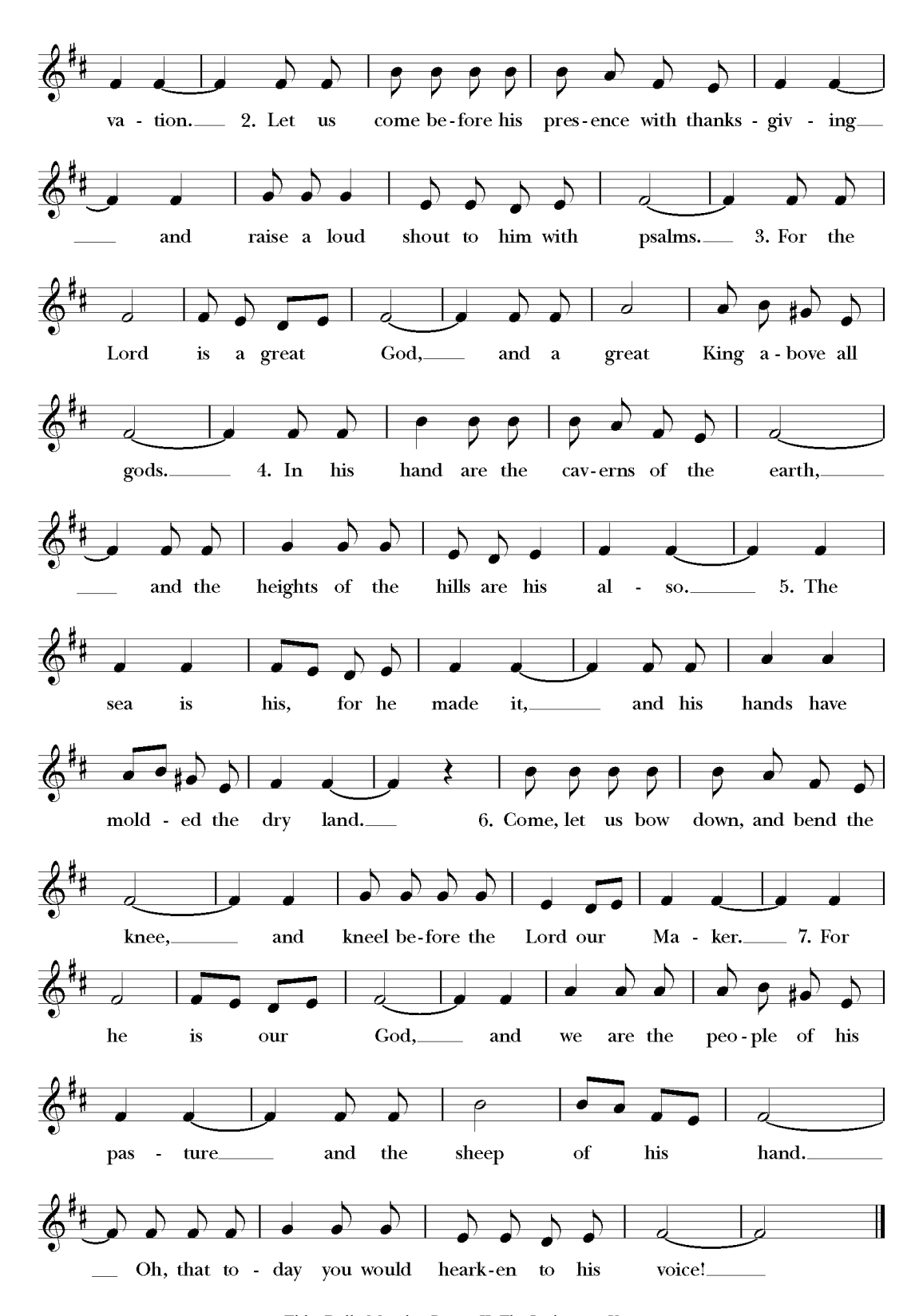
Title: Daily Morning Prayer II, The Invitatory: Venite Music: Jack Noble White (b. 1938)