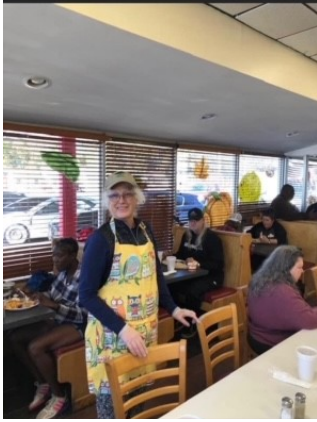
Thanksgiving at the Soup Kitchen