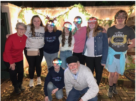
EYC Christmas Party