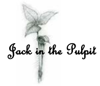
Jack in the Pulpit

"Your very lives are a letter that anyone can read by just looking at you. Christ himself wrote it—not with ink, but with God's living Spirit; not chisled into stone, but carved into human lives-and we publish it." 2 Corinthians 3:2-3