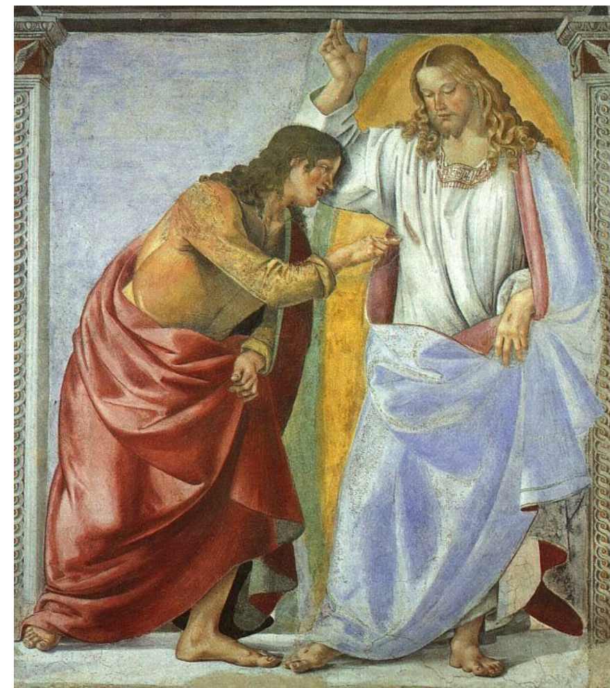
Luca Signorelli 1441-1523