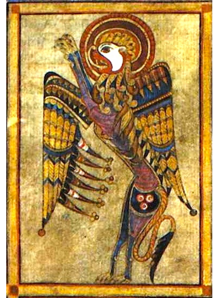
Book of Kells, Mark's Gospel 800 AD